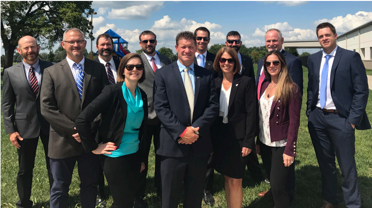
ABC members at President Trump's Tax-Reform policy speech in Springfield, MO.