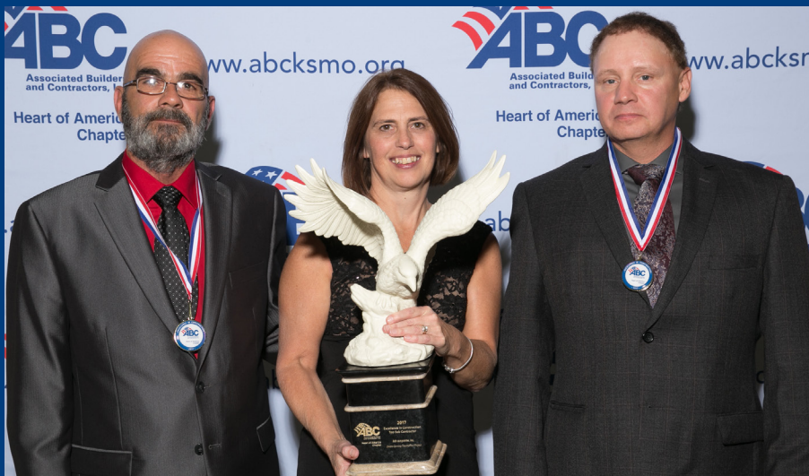
Subcontractor Project of the Year - hth companies, inc., Owens Corning Thermafiber Project