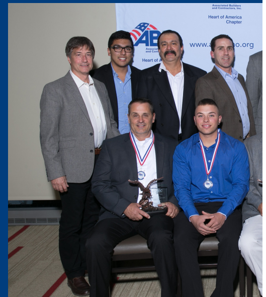
Excel Constructors, Inc. celebrated their Silver STEP Award and two General Contractor project awards.