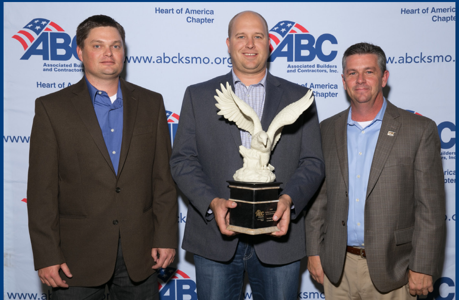
General Contractor Project of the Year - Emery Sapp & Sons, Inc., South Lawrence Trafficway