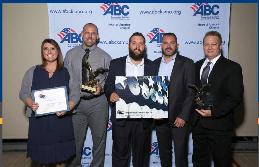
Teague Electric Construction, Inc. celebrated their 35 year anniversary, Subcontractor Project Award and Gold STEP award.