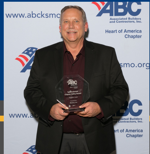
Ted Anderson Superior Safety Award, Wachter, Inc.