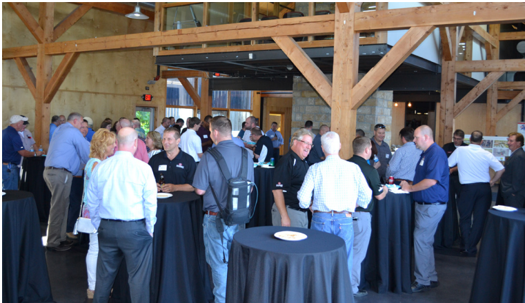
After Hours Hosted By Nahbolz Construction August 17, 2017