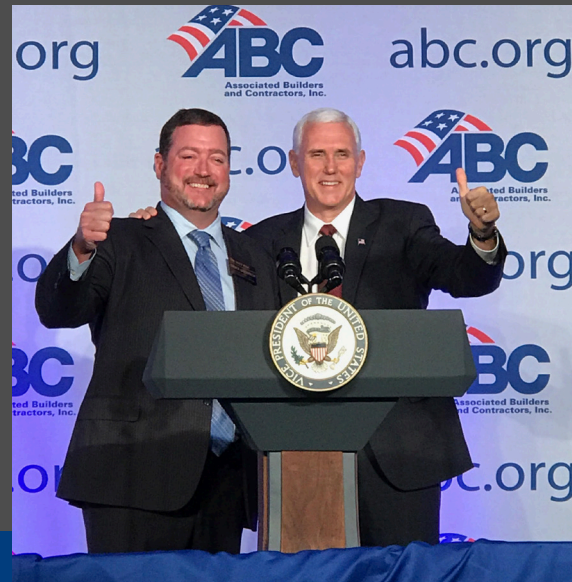
Vice President Pence addresses ABC members.