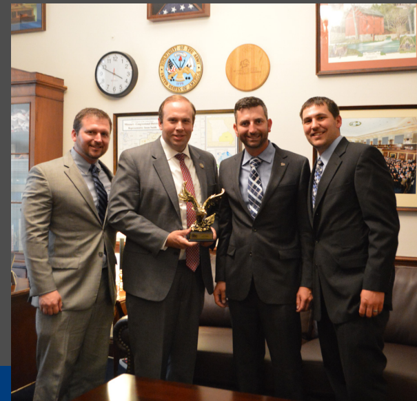
ABC members meeting with Congressman Jason Smith.