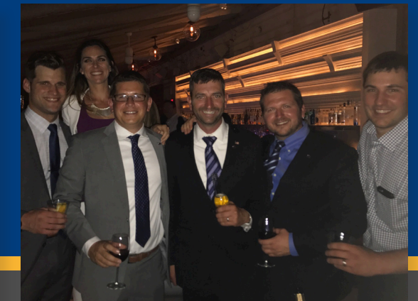
Several attendees are second generation ABC members. Firmly believing that you have to "Get into politics or get out of business" they are continuing a tradition started by their fathers of making the annual trek to Washington DC.