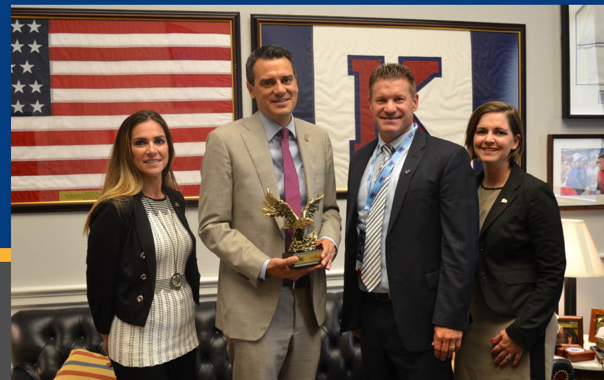
ABC members and President meeting with Representative Yoder.

This year, in addition to visiting with Congressmen and Senators on the Hill, ABC Heart of America hosted a reception for the Congressional Delegations of both Missouri and Kansas to have an opportunity to connect in a more casual setting. With a dozen members in attendance, ABC HOA was well represented.