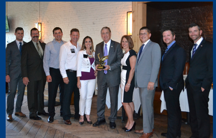
ABC members with Congressman Blaine Leutkemeyer