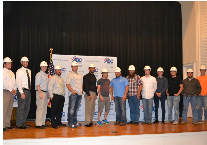
Our 2017 Kansas City Apprenticeship Graduates!