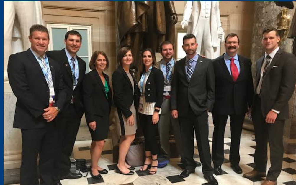
The group from ABC HOA enjoyed a tour of the capitol.