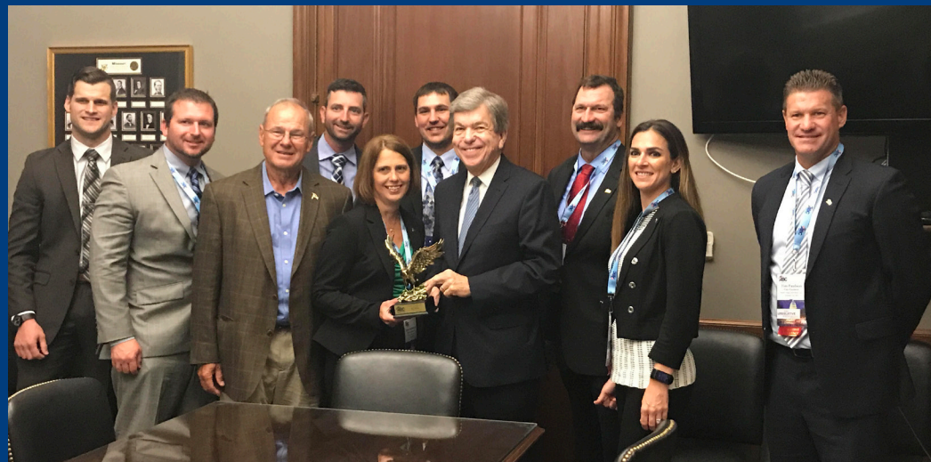
The delegation enjoyed meeting with Senator Blunt.